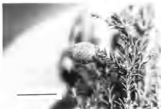
Fig. 1. Flower gall of Austrolopesia melaleucay sp. nov. on Melaleuca halmaturorum . Scale bar = 10 mm.

Cecidomyia frauenfeldi Schiner (1868) described from branch bud galls on Melaleuca sp. in Sydney, Australia, is placed for the first time in the genus Dasinenra (comb. nov.). It does not belong in